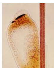
Nit or Egg