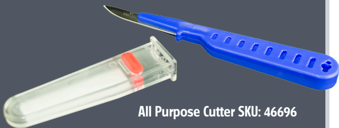
All Purpose Cutter SKU: 46696